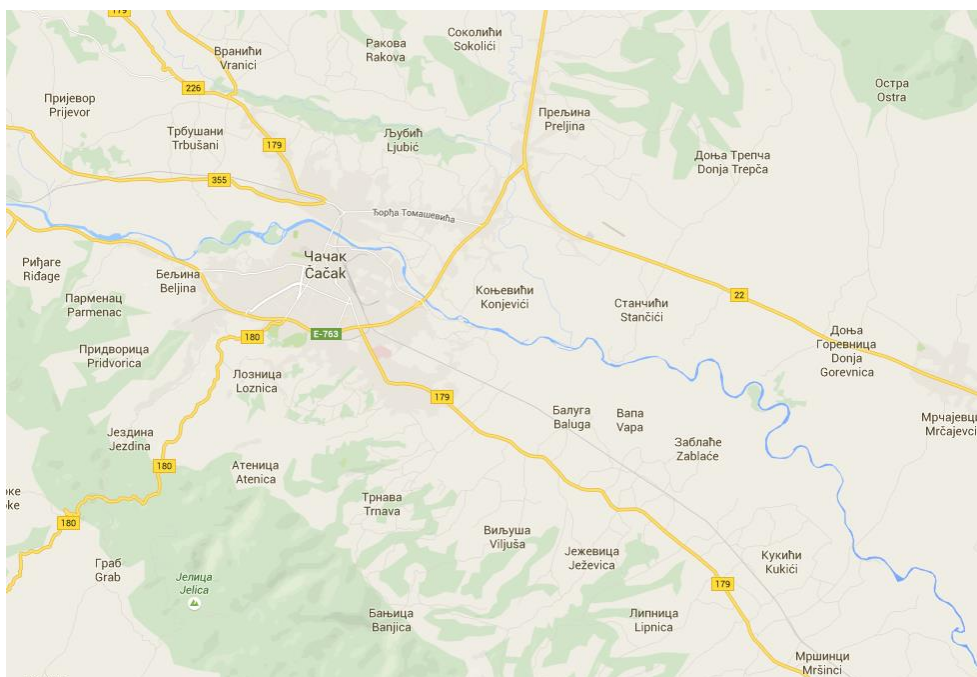
Fig. 1 – Čačak Valley.